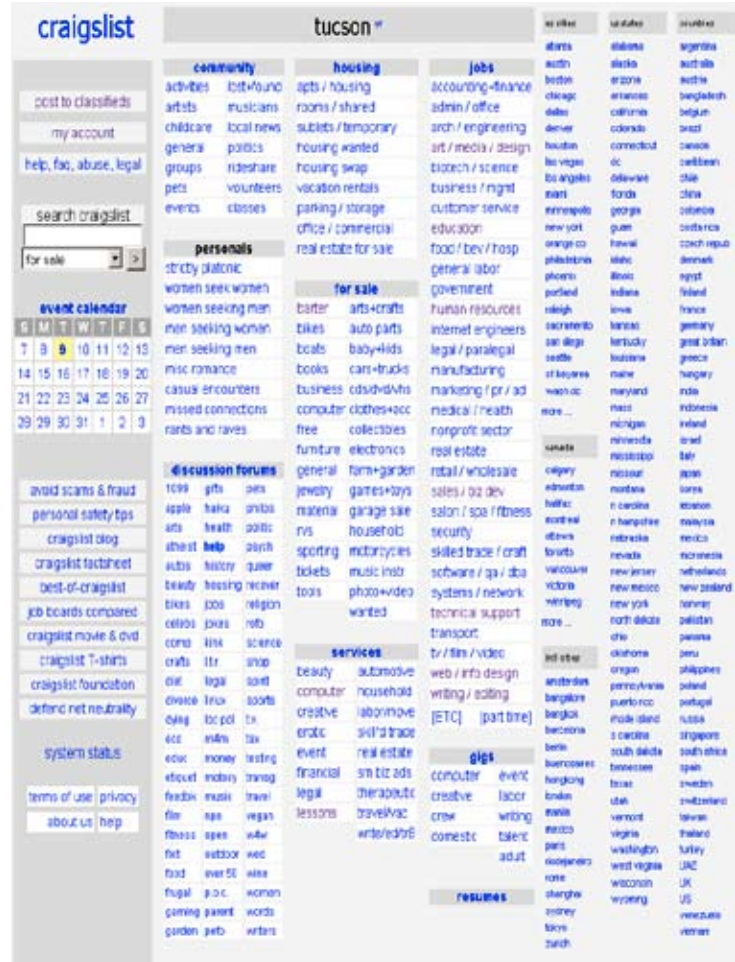
A screen-shot of the tucson.craigslist.org website