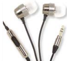
Platinum ev-Series model

This company makes a series of high fidelity earphones. Their product line includes the Platinum, Pro, Style, XP and XS series. Each has comfortable ear tips that conform to your ear, and a couple of sizes of tips for those with small or large ears.